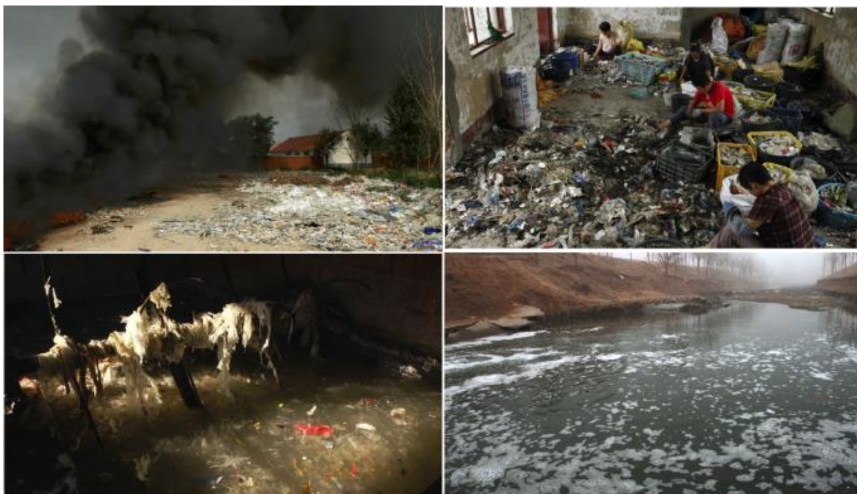
Figure 2: Smoke from burning plastic (top left); laborers sorting plastic waste (top right); a bath for washing plastic (bottom left); a polluted river (bottom right).