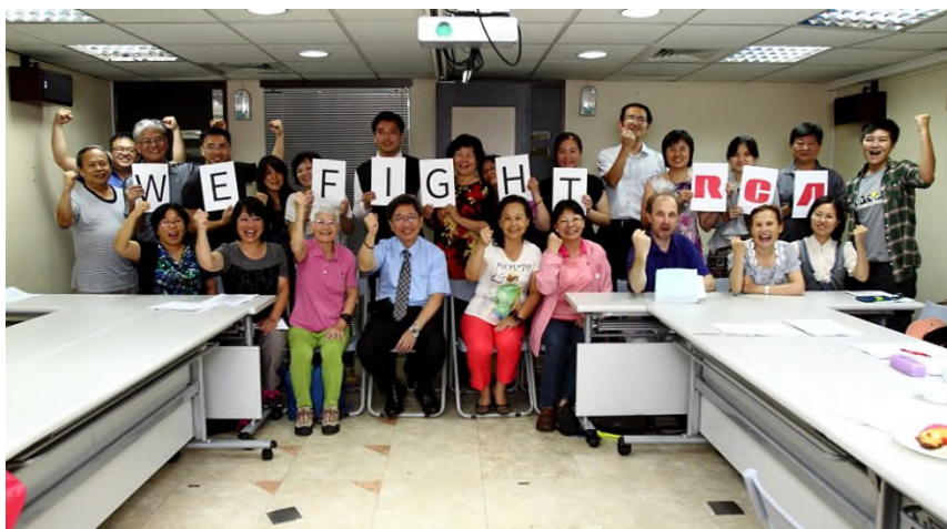
One of the numerous group meetings (of nearly one hundred) with a core group of workers, their lawyers and advisors, after the first verdict in July 2015.

in Chinese, so the many documents and scientific research papers written in English had to be translated into Chinese before being presented to the judges in court. While the defendant lawyers' foreign advisers and clients were accompanied by their (no doubt well-paid) professional interpreters in all the court sessions, the plaintiffs counted on student volunteers. There were a group of medical students and STS graduate students who actively participated in the translation efforts. Full texts of the nine RCA research papers were translated into Chinese, and sessions of English site-investigation reports, and the abstracts of many scientific reports discussed in the next two sessions were also translated before they were presented to the court by the expert witness or lawyers