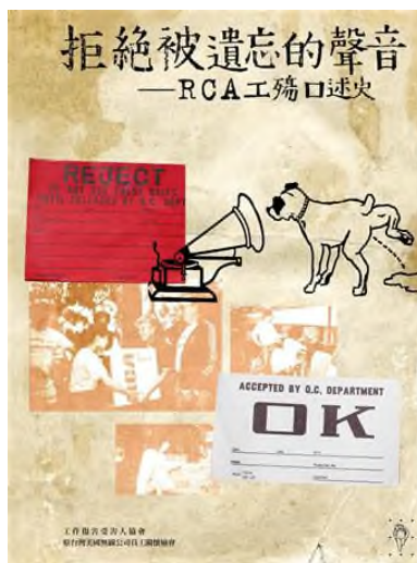
Book cover of the award-winning Voices not to be Forgotten

The third kind of translation, and the most difficult one, was from science to law. Both science and law have their own cultures and languages. During the RCA trials in the district court and the appeal court, a total of eleven expert witnesses testified in court; six called by the plaintiffs and five called by the defendants. With the exception of the law professor mentioned above, virtually all of them are college professors with doctoral degrees in medicine or natural science. They were used to teaching classes of students with science backgrounds or presenting their findings to colleagues at conferences; many of them were testifying in court for the first time in their careers. There has been considerable discussion about the competence of lay juries to evaluate such scientific and technical evidence in the common-law system.