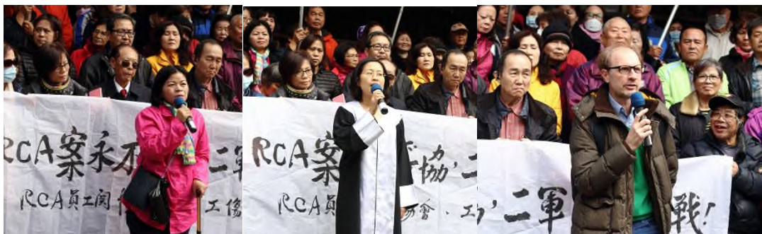
First court hearing for the second group of plaintiffs, at Taipei District Court, 21 December 2017.

The case is now pending in the Supreme Court for the five hundred plaintiffs, and another file has already started at the District Court for another group of one thousand plaintiffs. But this verdict has already paved the way for other cases in Taiwan, and could certainly inspire the mobilizations of other victims of toxic “slow violence” in other countries.