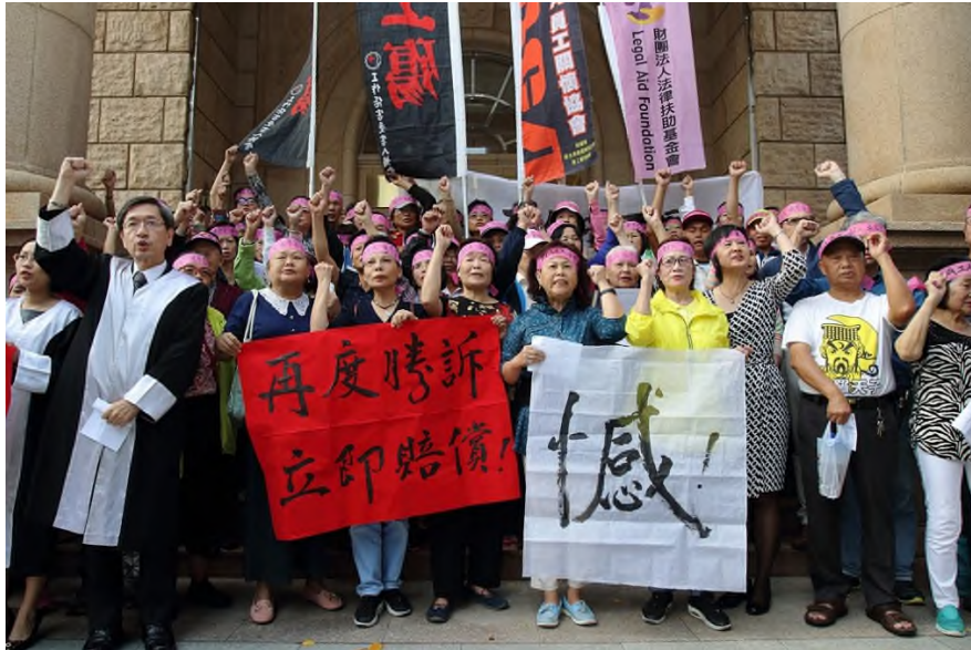
In front of the Taipei High Court, 27 October 2017. On the banners: “Another victory [for the plaintiffs]! Now pay compensation!” “Regrets” [for victims already deceased]