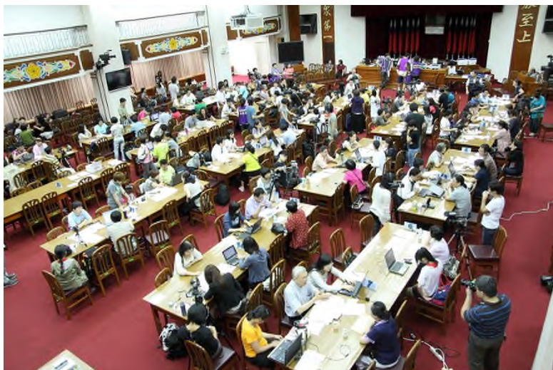
Hundreds of volunteer lawyers and students conduct a questionnaire survey for each plaintiff. Legislative Yuan, Taipei, 17 July 2011.