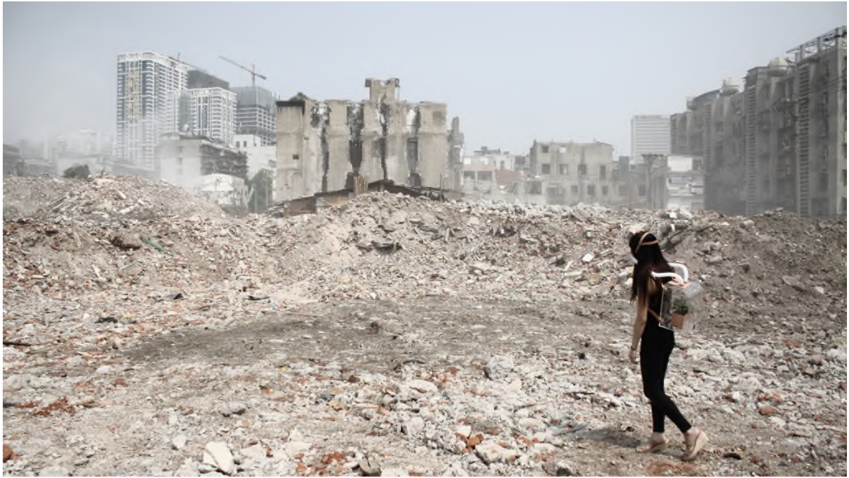
From the series A Voyage on the Planet. Conceptualised and photographed by Chiu Chih