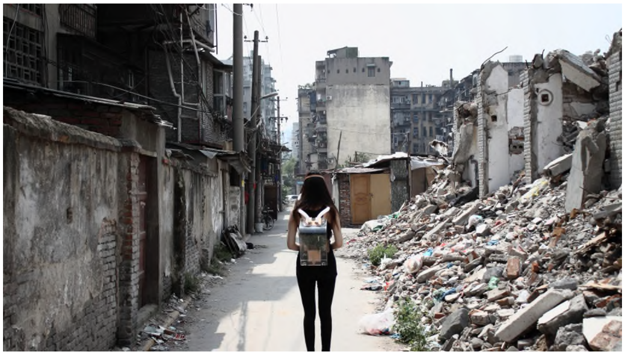
From the series A Voyage on the Planet. Conceptualised and photographed by Chiu Chih