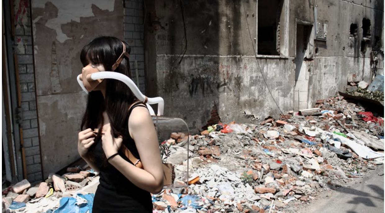
A lady wearing Chiu Chih's contraption walks through an urban wasteland. From the series A Voyage on the Planet. Conceptualised and photographed by Chiu Chih