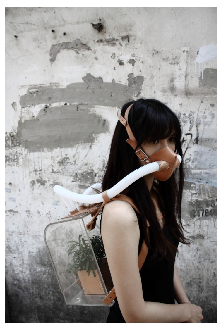
The transparent rucksack contains a plant, which connects to breathing apparatus: "The plant means something I brought from home to start an adventure with." From the series A Voyage on the Planet.

Please find some photographs of Chih Chiu's 'Voyage on the planet' below: