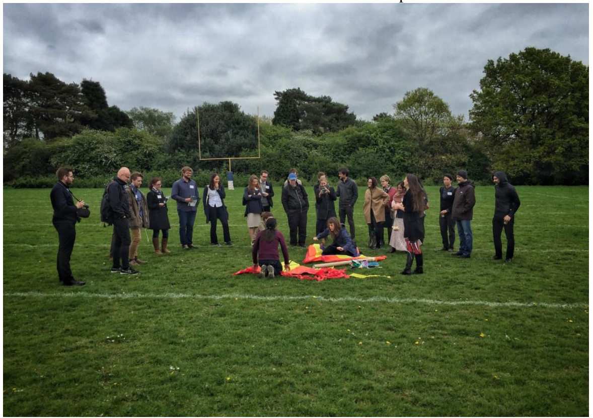
The workshop participants being shown how to assemble the kite.