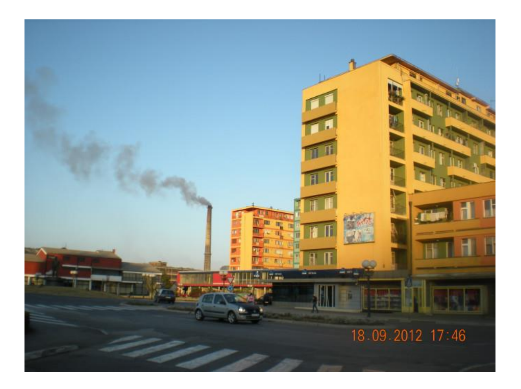
Bor 2012, Photo credit: author

The town of Bor is a copper-processing town in East Serbia that developed right "under the chimney". The rundown smelting plant and the worn out sulphuric acid plant (that was supposed to absorb the toxic gases from the smelting plant) are both located close to the old town centre. When I was living in Bor between 2012 and 2013, the by-product of the smelting plant or so-called "smoke" - how people from Bor referred to air pollution - frequently "fell down" onto the streets of Bor. It contained a great amount of sulphur dioxide, but also arsenic, lead, zinc, cadmium, and soot, among other particulate matter.