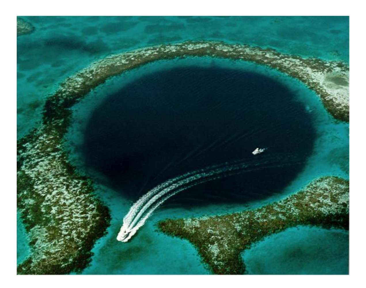
'Dis da fi wee'? (3)

In addition to the potentially toxic effects on the environment, one of the main flashpoints in the conflicts surrounding oil drilling occurred around the struggles over the rights of some of Belize's indigenous Maya peoples. Since 2005, the Sarstoon-Temash Institute for Indigenous Management (SATIIM), co-manager of the Sarstoon Temash National Park, a protected area in southern Belize, has been engaged in ongoing disputes with the Government of Belize over the latter's granting of a permit for seismic drilling in the park . Not only was the creation of the park itself seen as a potential threat to the Maya communities who had occupied the area for generations, but the granting of permits to a foreign company without the permission of these communities was seen as a deliberate disenfranchisement of these people from their traditional lands. (The majority of indigenous peoples in Southern Belize are officially landless).