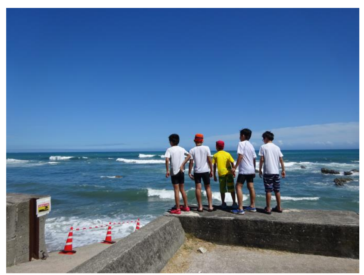
Five boys from Fukushima City gaze out to sea after a satisfying day of swimming and finding sea creatures. Minami-boso, Chiba Prefecture.

While some have deliberately chosen to remain in Fukushima, many others have remained for lack of a feasible alternative, despite deep concerns regarding their children's health. Financial, work, and family constraints leave them with little choice, and government policies have all but abandoned them. Concerned residents—particularly young mothers—are continually in search of ways to find peace in their decision to stay and to minimize harm to their children in whatever way possible. Evacuation retreat leaders hope that they can provide temporary mobility, respite, and access to new social networks and opportunities. This is a story about how normal citizens have mobilized in the face of daunting, uncooperative power structures and invisible hazards—and it is one that is sure to continue for many years to come.