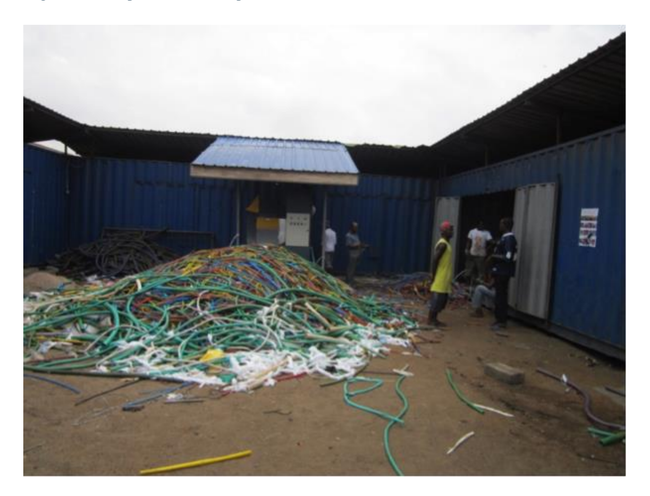
Plastic discard from the e-waste granulator.

insulation from the valuable aluminum (see above photo). The NGOs supporting the use of these granulators include Green Advocacy Ghana and the Pure Earth organization (formerly Blacksmiths Institute) which is a solutions-based international environmental NGO that targets the most polluted or toxic places on Earth.