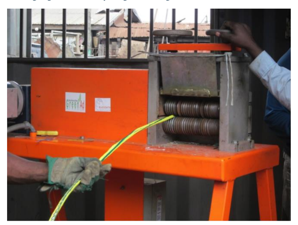
The granulator in action.

This is one of several cable stripping machines, also known as granulators, used at the ARC. Pure Earth/Blacksmiths organization has helped train six workers to use the granulators who, when a shipment of wires arrives, feed the cables through the machines to separate the plastic