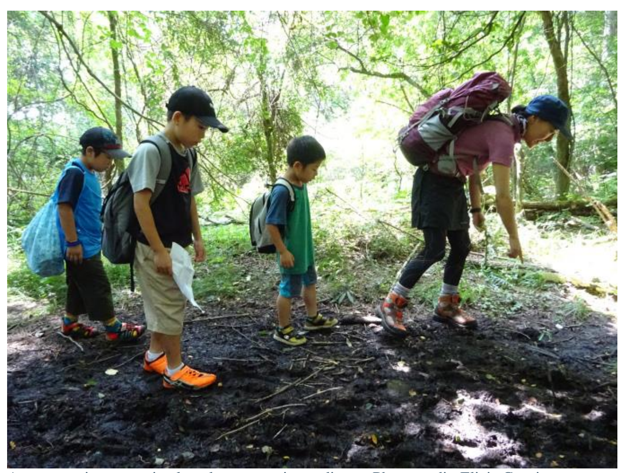
A ranger points out animal tracks to a captive audience.

always stay at an environmental education non-profit's facility in Yamanashi prefecture and hike with the very knowledgeable rangers on staff.