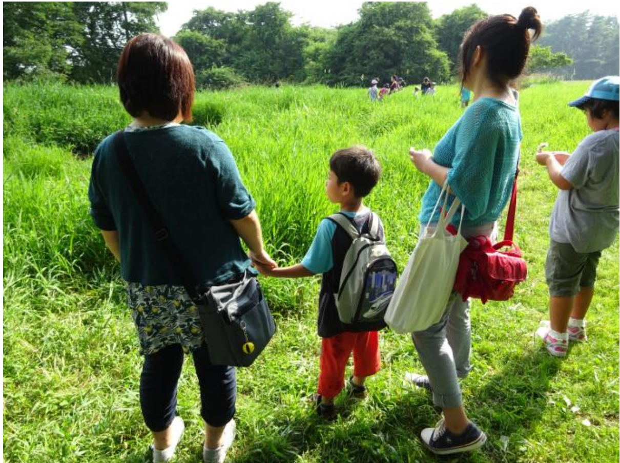
Two mothers and their children take a break from grasshopper-catching.

In such a climate, it is no wonder that many mothers with young children feel isolated and highly stressed, and struggle to access information about radiation and health, methods of reducing exposure, or the range of available retreat programs. Some retreat leaders have even told me that some mothers attend retreats in secrecy for fear of being judged by community or family members; these individuals ask not to be photographed in any material that appears on retreat blogs or other social media platforms. I'll never forget when one mother explained to me that her neighbor once knocked on her door after she returned from a retreat program with her two children, questioning where she'd been and why.