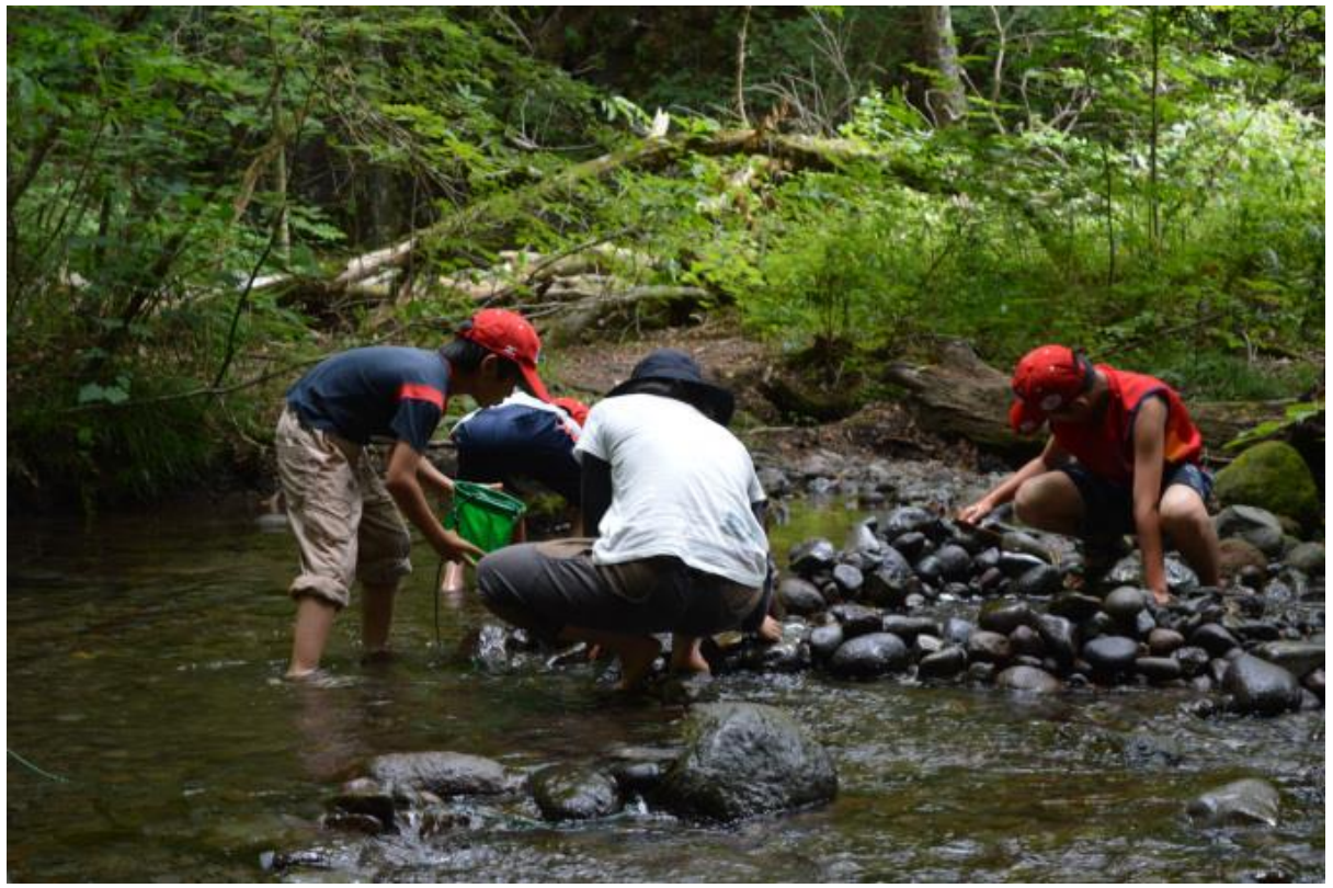
Discovering small creatures in the river.

Children may also benefit psychologically through the chance for unlimited playtime in outdoor environments like the ocean, rivers, forests, and outdoor playgrounds. The healing and health-promoting impacts of outdoor environments, including such benefits as stress reduction, attention restoration, and the evocation of positive emotions, have long been recognized in public health, environmental psychology, and geography scholarship.