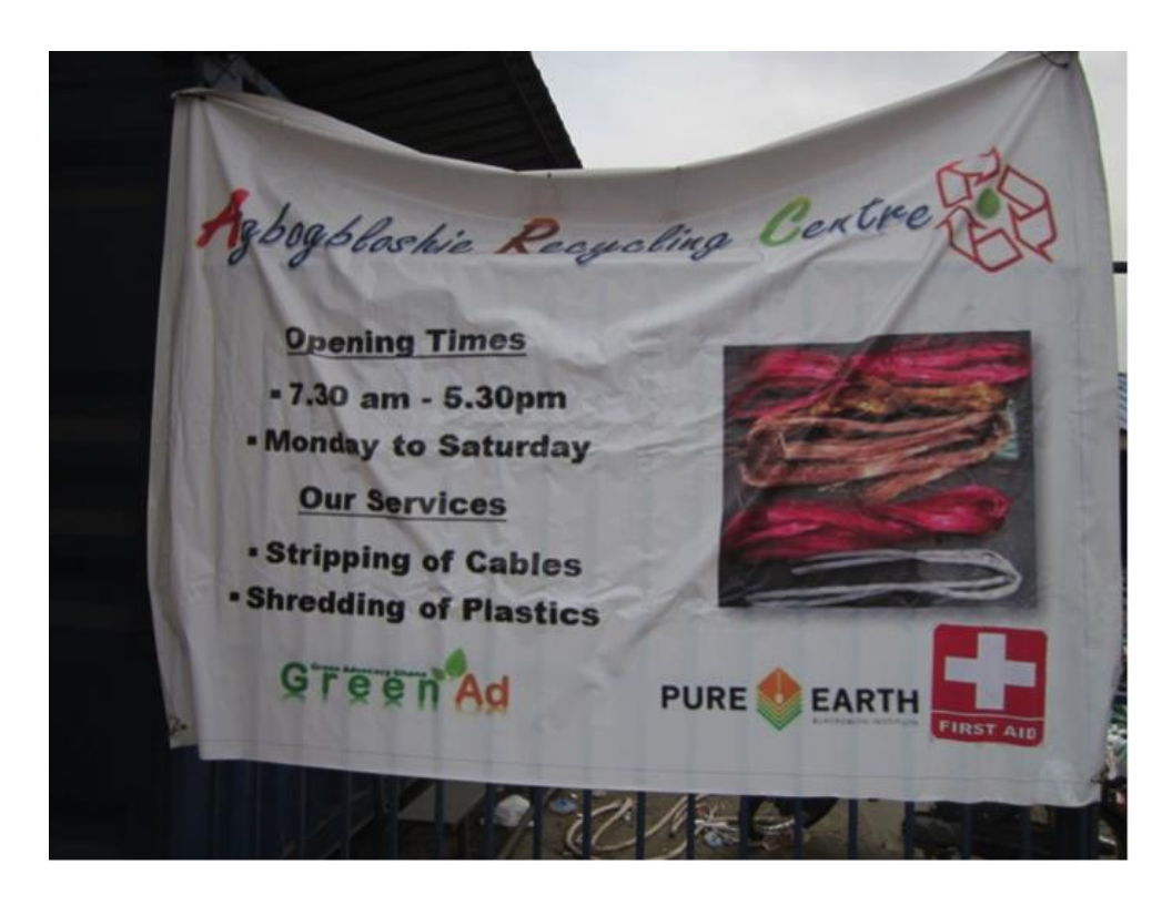
The Agbogboloshie Recycling Center sign.

pollution in Agbogbloshie—by using automated machines to strip coated cables and wires of various sizes containing copper and other valuable, yet toxic, materials.