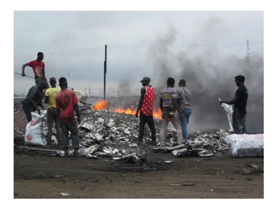
Workers breaking down their aluminum scrap.

Aluminum is another sought after metal in this landscape of DEEDs. Once heated and broken down, sheets of aluminum are packed tightly into large white bags (see photo above). In the summer of 2016, aluminum was selling for 1.7 Ghana Cedi (about 40 cents) per pound. A full bag weighs about 25-30 pounds, so they make about $10-12 per bag, but observe how many workers there are, which means the profits are distributed among the workers.