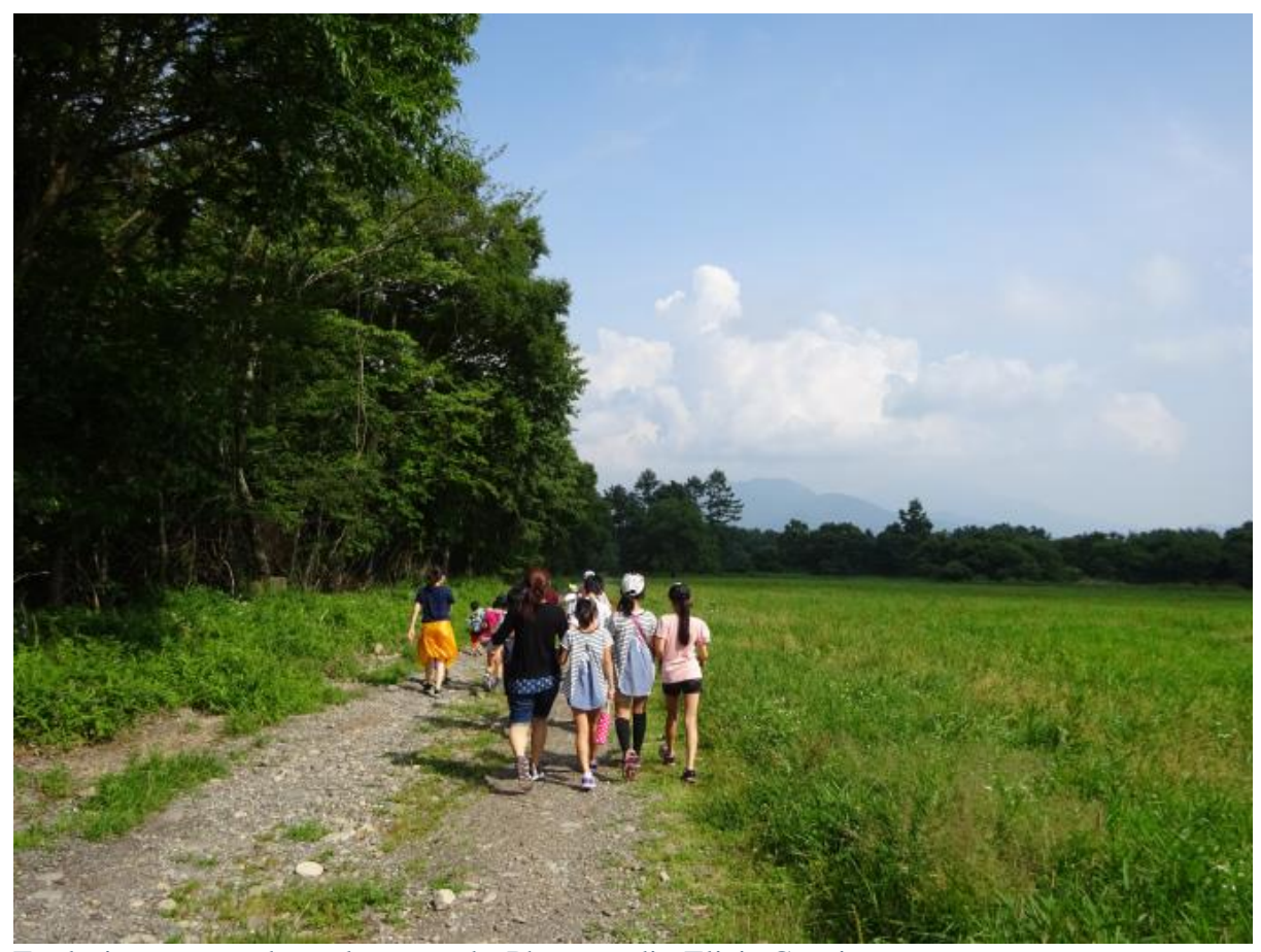
Exploring new outdoor playgrounds.

The third broad goal has to do with stress relief and building social capital, particularly for participating adults. Mothers often describe the immense joy of seeing their children look so happy and energized, and the relief of not having to constantly say, "no, you can't touch that," or "no, you can't play over there." As one mother shared with me after the first retreat I led, "When my daughter and I were looking at photos from the trip after we returned to Fukushima, she turned to me and said: "Mommy, I was happy because you looked like you were having so much fun." As mentioned earlier, retreats also provide valuable opportunities for networking with like-minded mothers and highly sympathetic staff members and volunteers. Many stay in touch through Facebook and instant messaging, continuing to support each other, share frustrations, exchange useful information, or even share avenues to activism. For some mothers, retreats offer the final nudge of inspiration and confidence to pick up and move with their children, even if it may lead to further financial instability, divorce, and leaving extended family behind.